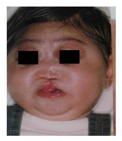
Fig. 3: Holoprosencephalic patient after lip and nose deformity reconstruction

We describe a case of variant Klinefelter syndrome with 48XXXY/46XY mosaicism and cleft palate. There were 2 cases of cleft palate with varriant types of Klinefelter syndrome reported in the past. Our case entered in cleft workup after initial managements and genetic studies. We repaired his cleft lip and cleft palate in 2.5 and 12 months respectively (Fig. 3). One sided nostril and short clumella were reconstructed in combination with revision surgery. The patient ws hospitalized