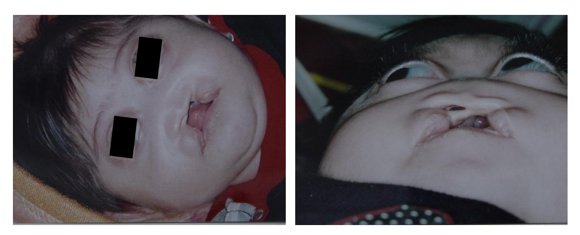
Fig.1: Holoprosencephalic patient photography from anterior (left), note to wide lip and alveolar cleft; and from below (right), note to midface deformity

0n physical examination, phenotypic abnormalities including bilateral cleft lip/palate and low-set ears, hypotelorism, exophthalmous, one sided nostril without columella, absence of premaxilla, underdeveloped septum and vomer (arinia) with microcephaly were observed (Fig. 1). The other physical and laboratory findings were the cardiac, ventricular, normal in and genitourinary systems. In neurologic evaluation he has generalized epilepsy that is controlled with 15 mg phenobarbital bid. The genitalia were normal without ambiguity, and both testes were palpable outside the inguinal rings. The karyotype of peripheral blood lymphocytes was 47,XXY/46,XY. The head CT scan revealed colpocephaly and overriding parietooccioital suturs (Fig. 2).